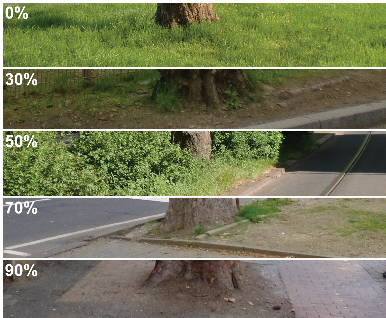
Figure S2. Estimates of impervious cover ranging from 0% to 90%.